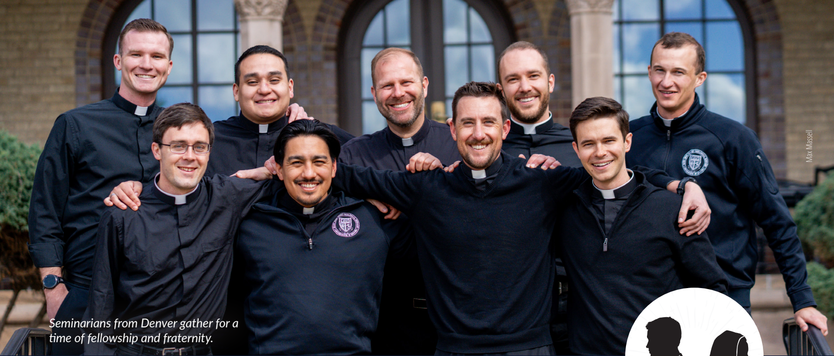
Seminarians from Denver gather for a time of fellowship and fraternity.