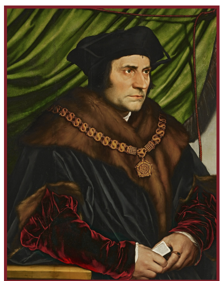
Mass followed by the 16<sup>TH</sup> ANNUAL BENCH AND BAR AWARD DINNER with presentation of the St. Thomas More Award

The Sutter Club 1220 9th Street Sacramento, California 95814