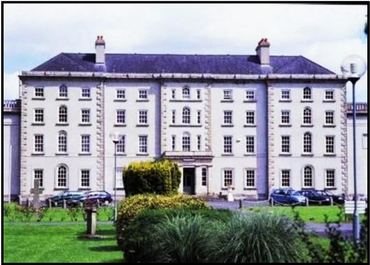
Photo of Carlow Seminary is taken from the Web