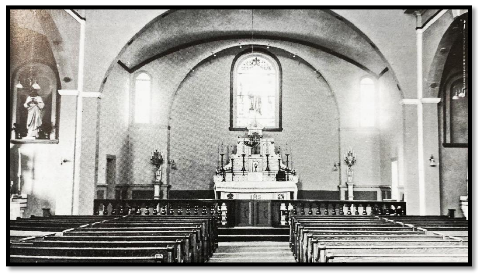
Saint Joseph Church, Auburn, Built in 1911