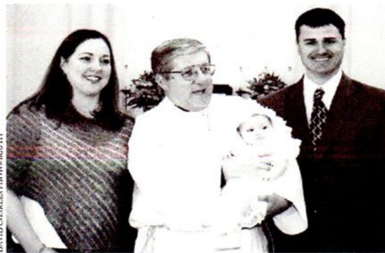
Priest and parents celebrate a newly-baptized child

God himself. In the book of Wisdom, we hear this beautiful hymn to supernatural wisdom: "[I]n her there is a spirit that is intelligent, holy, unique, manifold, subtle, mobile, clear, unpolluted, distinct, invulnerable, loving the good, keen, irresistible, beneficent, humane, steadfast, sure, free from anxiety, all-powerful, overseeing all, and penetrating through all spirits that are intelligent and