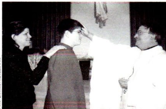
The Sacrament of Confirmation is conferred

Fear of the Lord is our " instruction in wisdom " (Prv 15:33); " wisdom is the fulfillment of the fear of the Lord " (Sir 21:11). This wisdom is not wisdom as the world understands it, as St. Paul tells us: " If any one among you thinks that he is wise in this age, let him become a fool that he may become wise. For the wisdom of this world is folly with God " (1 Cor 3:18-19). We seek not worldly wisdom, but that bestowed by