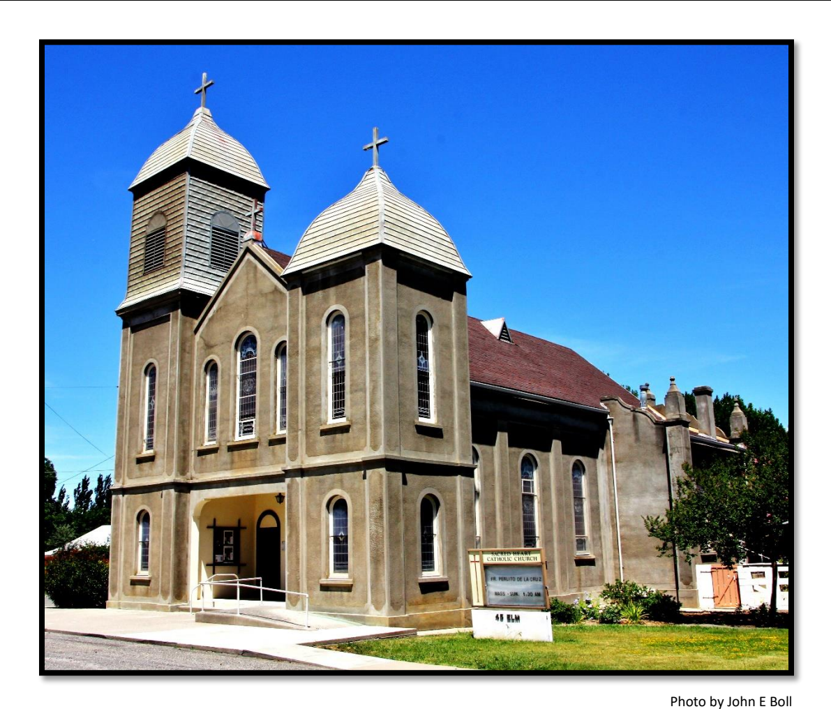
Sacred Heart Church, Maxwell