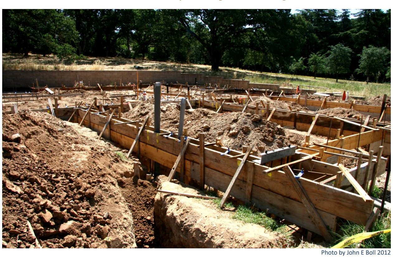
The Footings of Unit 8