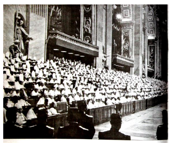
For good or ill, something happened at Vatican II