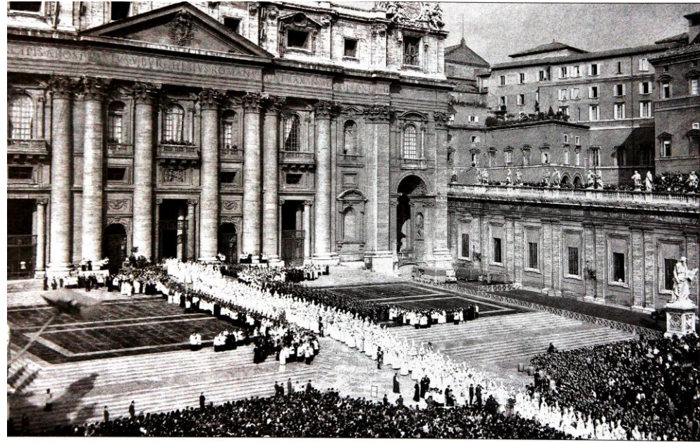
white-clad prelates walk into St. Peter's Basilica on Oct. 11, 1962, to open the Second Vatican Council.