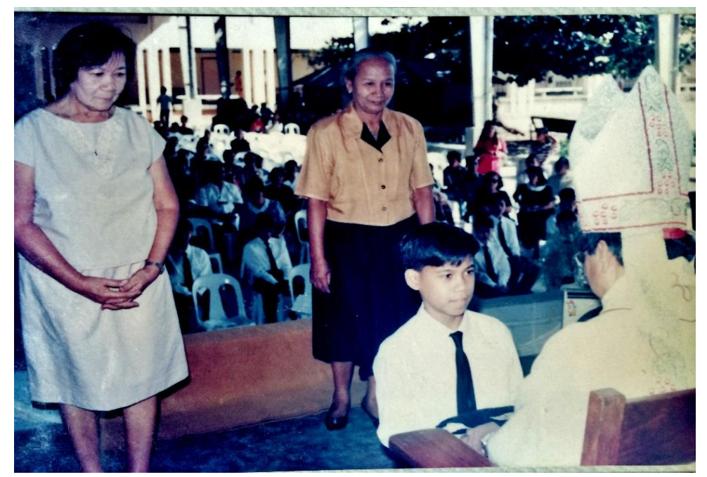
Rite of Investiture, Immaculate Conception Minor Seminary, Vigan City, Philippines