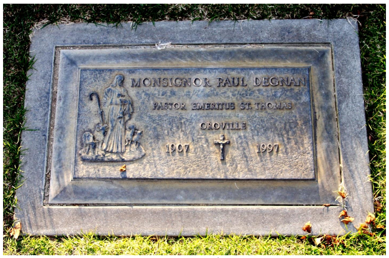
Monsignor Degnan's Grave Priests' Section, Calvary Cemetery, Sacramento