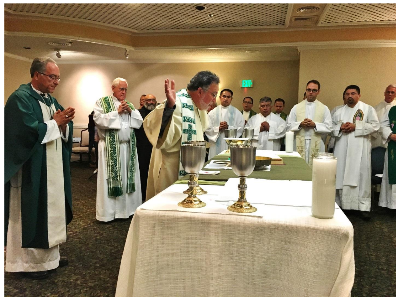
Bishop Myron Cotta Presided at Tuesday's Eucharist with Bishops Soto and Weigand