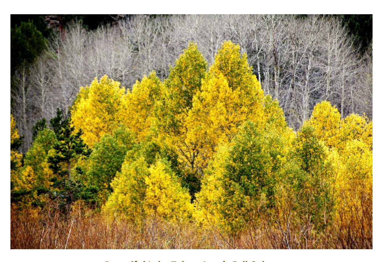
Beautiful Lake Tahoe Area's Fall Colors