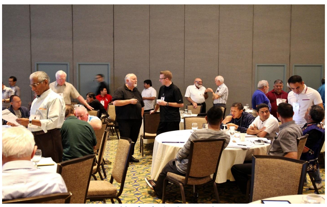
Waiting for the Session to Begin