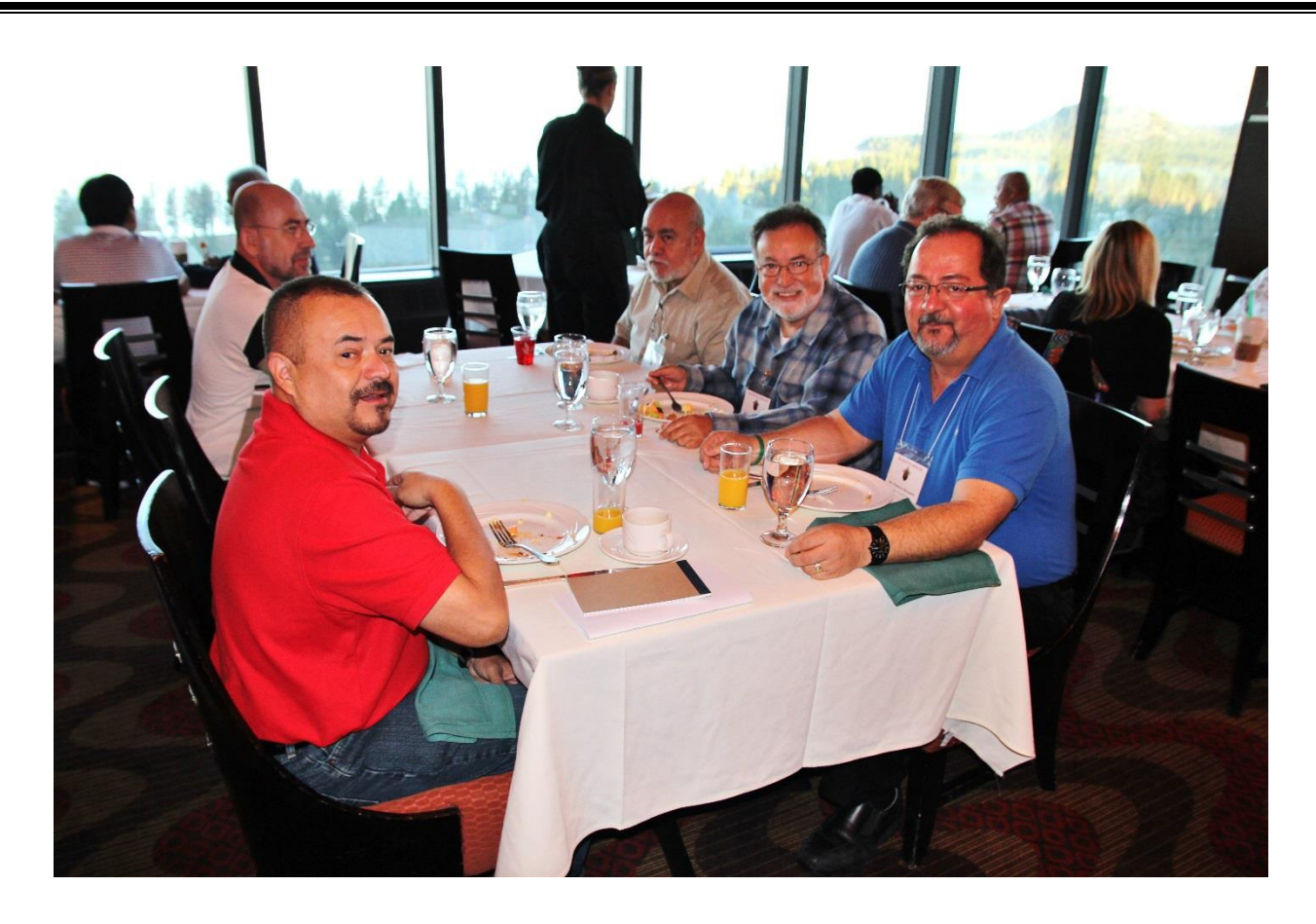
Breakfast on the 19<sup>th</sup> floor Overlooking Lake Tahoe