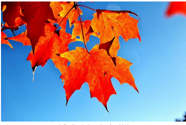
Fall colors in Etna, October 2015