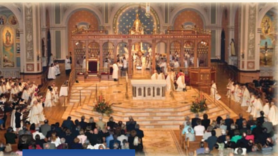
November 2005 Rededication of the Cathedral of the Blessed Sacrament, Sacramento, California