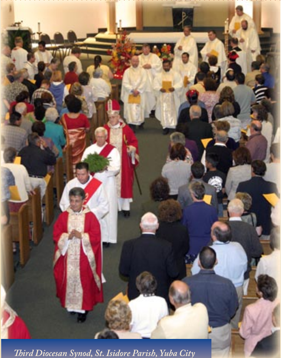
Third Diocesan Synod, St. Isidore Parish, Yuba City